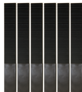
Screws, Anchors and Shims (6 each)